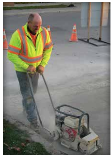
Figure 12. Once the pavers are in place, the joints are filled with dry joint sand and the surface is compacted.

A thin layer of neoprene-asphalt adhesive is then applied with a squeegee to the top of the bedding layer, and allowed to cure (typically 1 to 2 hours). Some adhesives are a more viscous and are applied with a straight edged towel as shown in Figure 8. The adhesive takes a hazy appearance when ready to mark baselines and place the concrete pavers (Figure 9). Only enough adhesive should be applied that will be covered with pavers in a day's work. Figure 10 shows the paver installation. Once the pavers are placed on the adhesive, they are very difficult to remove. If removed, they can pull up the adhesive and bitumen-sand bedding under the paver. Once all the pavers are in place including cut units, sand is swept into the joints and pavers are compacted until the joints are full (Figures 11 and 12). For more efficient work, sand sweeping and compaction can be simultaneous. Unlike sand-set pavers, there is no need to compact the pavers without sand in the joints first. When completed, the pavement can accept traffic loading immediately (Figure 13).