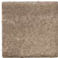
JAMES RIVER RANGE Special Order A warmer color option — Eagle Bay is the only manufacturer to offer another color choice