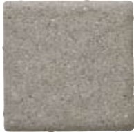
NATURAL GRAY In-Stock