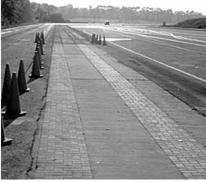
Figure 5. The test track section and concrete paver surface at The Pennsylvania Transportation Institute test facility.