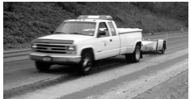
Figure 4. ASTM E 274 Test Equipment consists of a truck and trailer assembly. A tire within the trailer is towed at a given speed, locked, and skidded across water dispensed on the pavement in front of it.