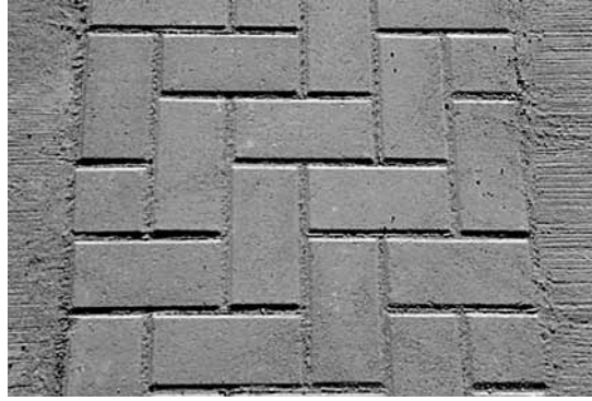
Figure 6. A close-up of the concrete paver surface at the PTI test track.