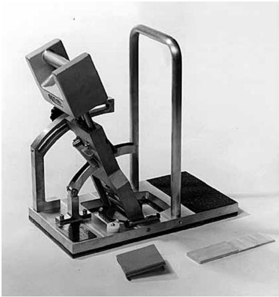
Figure 2. The NIST-Brungraber Mark II tester for slip resistance

Section 302.1 of the 2010 Standards for Accessible Design states, "Floor and ground surfaces shall be stable, firm, and slip resistant and shall comply with 302" (1). This document gives no express value for slip resistance. Typical values are expressed as a minimum coefficient of friction of 0.6 for accessible routes and 0.8 for ramps (dry surfaces) (2). These are advisory recommendations and are not standards. Design and testing standards may be required by the Occupational Safety and Health Administration (OSHA) for workplace safety, by other federal, state, provincial, or local regulations.