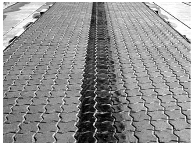
Figure 8. Test surface at the NASA ADLF facility