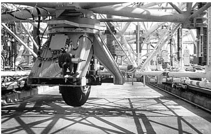
Figure 7. Test equipment for evaluation of the friction properties of concrete pavers at NASA's Aircraft Dynamics Landing Facility (ADLF) in Langley, Virginia