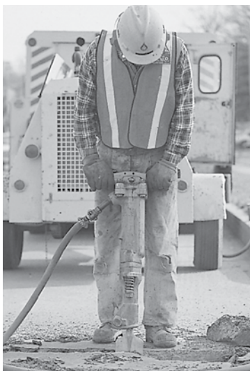
Figure 1. Repairs to utilities are a common sight in cities, incurring costs to cities and taxpayers.

The annual cost of utility cuts to cities is in the millions of dollars. These costs can be placed into three categories. First, there are the initial pavement cut and repair costs .