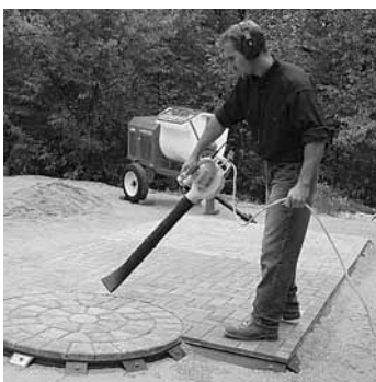
Figure 6. Whether using liquid or dry joint stabilization materials, the surface of the pavers should be cleaned with a blower or broom after the joint sand is compacted into the joints.

Stabilization benefits pavements subject to aggressive, regular cleaning. Examples might include amusement parks and restaurant exteriors. Pavements that see regular, heavy rainfall can benefit from stabilization of the joint sand. Surfaces that experience concentrated water flow such as gutters receiving sheet flow from large areas or at the drip lines under the eaves of buildings will better resist erosion of joint sand if stabilized.