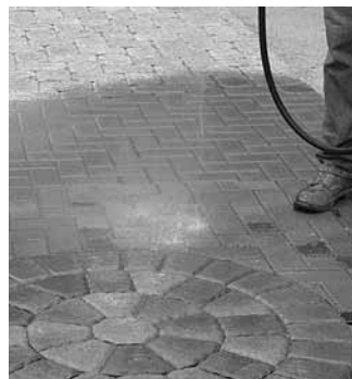
Figure 7. Dry-applied joint sand with a stabilizer is wetted in order to activate it and stiffen the sand. Once the joints dry, they are stabilized.

Stabilizers have been effective in securing joint sand in places subject to high winds such as in desert climates. They can prevent joint sand displacement from high-speed tire traffic. Like sealers, joint and stabilization materials reduce the potential for weeds and ants in the joints. In residential applications stabilization at downspouts and under eaves helps keep joint sand in place. Tumbled pavers (cobble stone-like units) and circular patterns have wider joints than other paver shapes. Tumbled pavers may require stabilized joint sand between them if they have slightly irregular sides and wide joints.