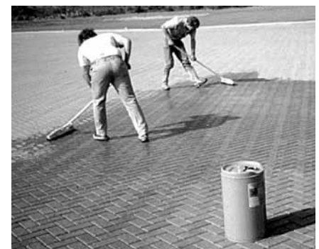
Figure 10. Urethane is applied with squeegees to stabilize joint sand between pavers on aircraft pavement.

Sealer should be spread and allowed to stand in the chamfers, soaking into the joints. Penetration