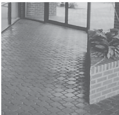
Figure 1. Many sealers enhance the appearance of concrete pavers and protect against staining.

Commercial stain removers available specifically for concrete pavers provide a high degree of certainty in removing stains. Many kinds of stains can be removed while minimizing the risk of discoloring or damaging the pavers. The container