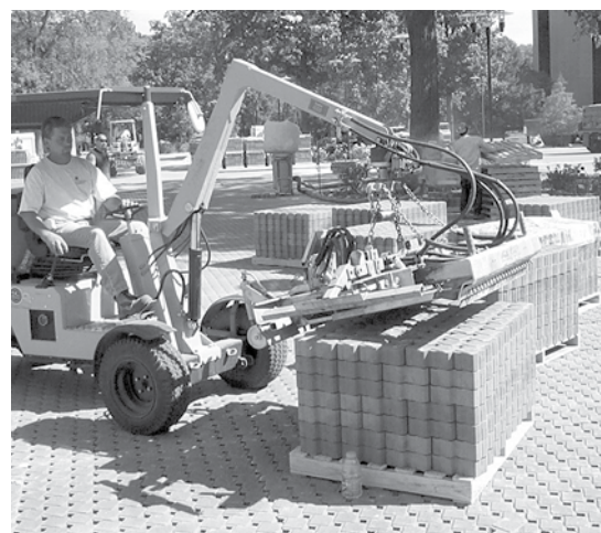
Figure 1. Mechanical installation of interlocking concrete pavements (left) and permeable units (right) is seeing increased use in industrial, port, and commercial paving projects to increase efficiency and safety.