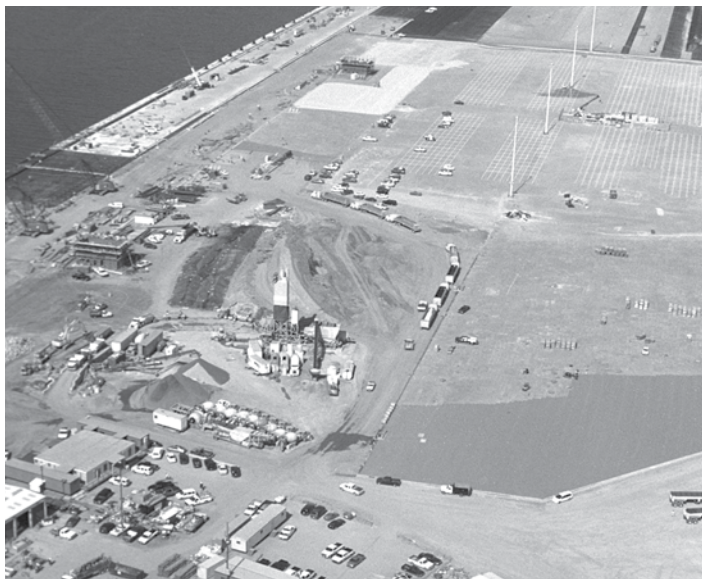
Figure 14. The Port of Oakland, California, is the largest mechanically installed project in the western hemisphere at 4.7 million sf (470,000 m 2 ).

ASTM C 936, Standard Specification for Solid Concrete Interlocking Paving Units, Annual Book of Standards , Vol. 04.05, ASTM International, Conshohocken, Pennsylvania, 2008. CSA A231.2, Precast Concrete Pavers , Canadian Standards Association, Rexdale, Ontario, 2006. ASTM C 140 Standard Test Methods for Sampling and Testing Concrete Masonry and Related Units, Annual Book of Standards , Vol. 04.05, ASTM International, Conshohocken, Pennsylvania, 2007. ASTM C 418, Standard Test Method for Abrasion Resistance of Concrete by Sandblasting, Annual Book of Standards , Vol. 04.02, ASTM International, Conshohocken, Pennsylvania, 2005. BS 6717: Part 1: 1993, Precast Concrete Paving Blocks . British Standards Institute, London, England, 1993. Dowson, Allan J., Investigation and Assessment into the Performance and Suitability of Laying Course Material , Ph.D. Dissertation, University of Newcastle, England, February, 2000. ASTM C 33, Standard Specification for Concrete Aggregates, Annual Book of Standards , Vol. 04.02, ASTM International, Conshohocken, Pennsylvania, 2007.