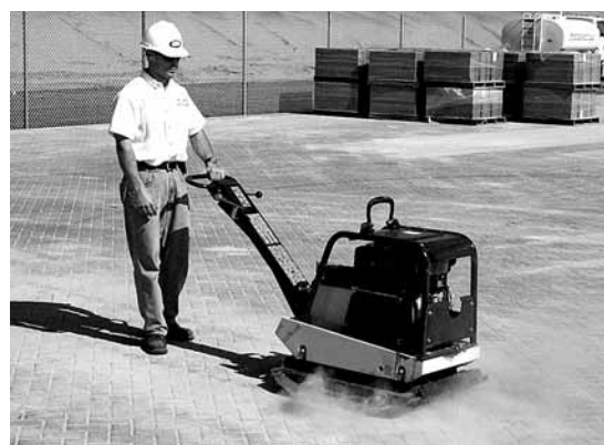
Figure 12. Final compaction should consolidate the sand in the joints of the concrete pavers.